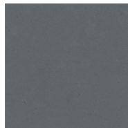
EAFS56501 LRV: 17