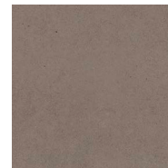
EAFS56504 LRV: 22