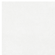
EAFS56500 LRV: 51