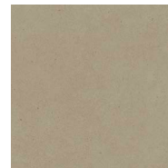
EAFS56503 LRV: 27