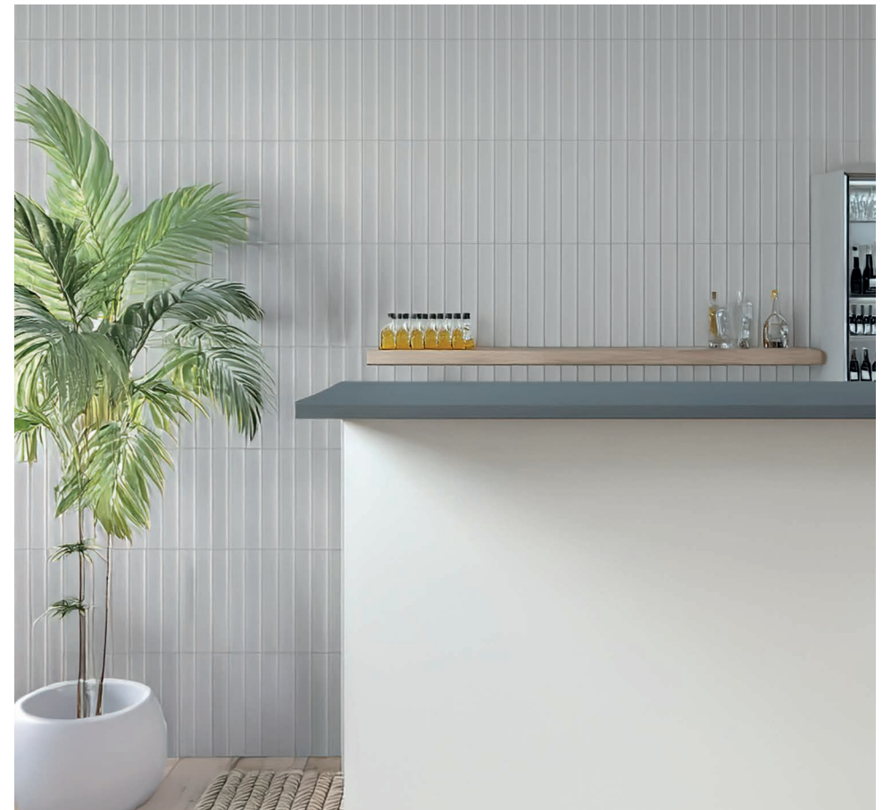
Above Dalby WBDA55500