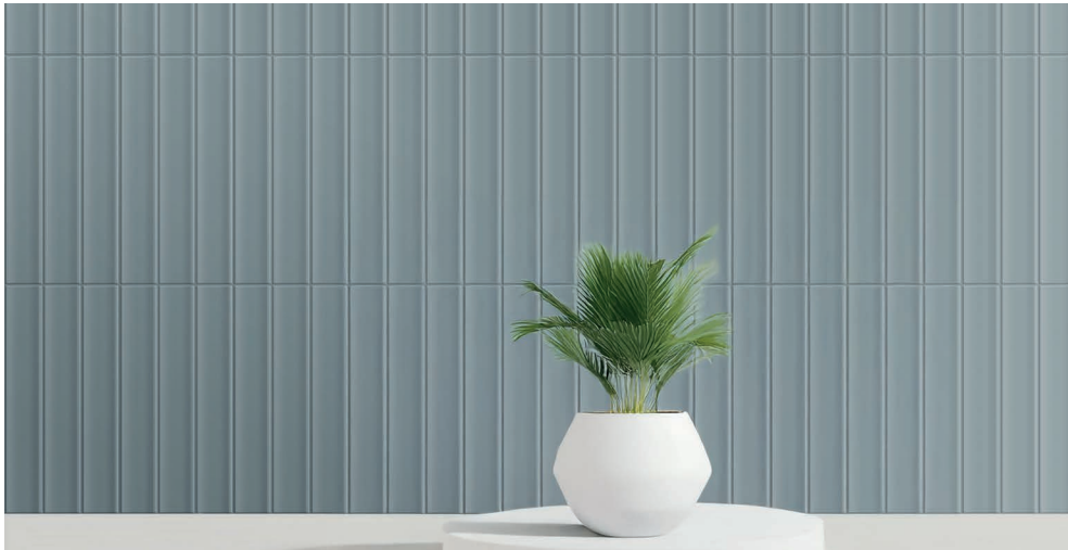
Above Dalby WBDA55503