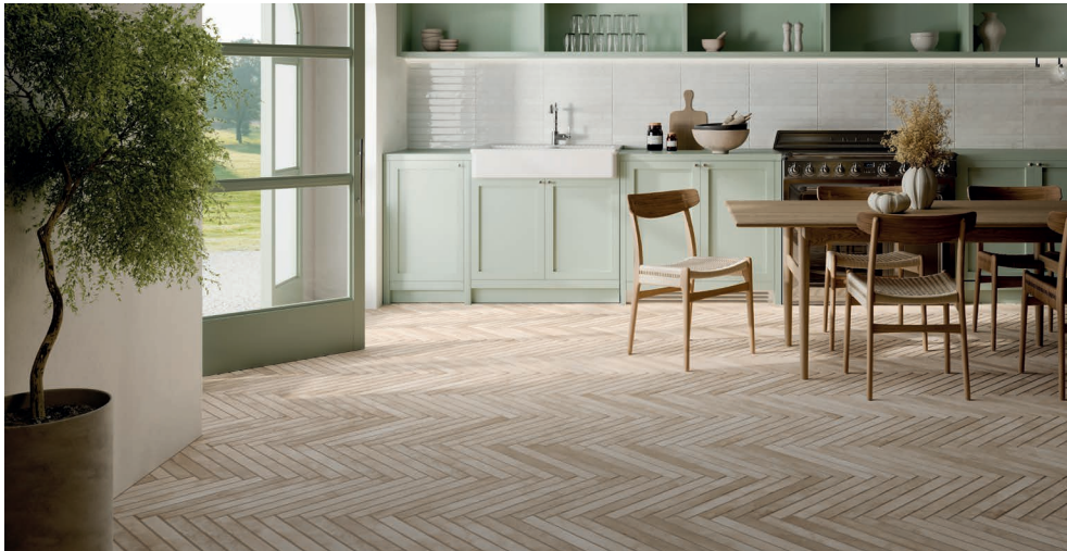
Above Earthbound ELEB42116