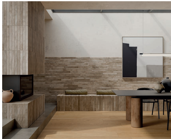
Right Earthbound ELEB42116