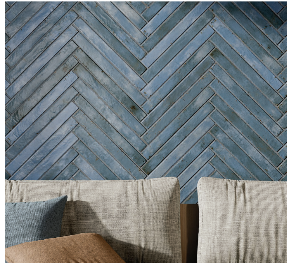
Above Earthbound ELEB42113