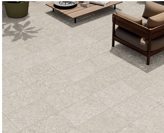
Right Ceppo Fleck RBEB55212