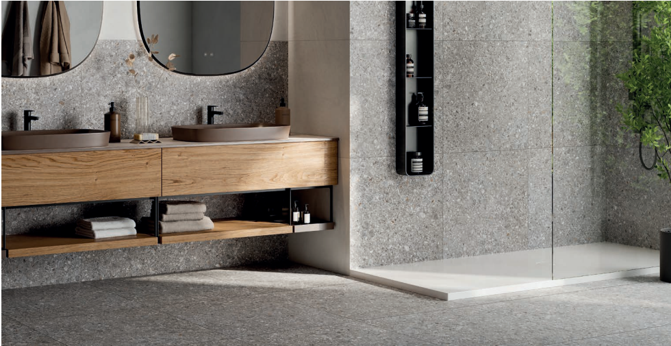
Above Ceppo Fleck RBEB55210