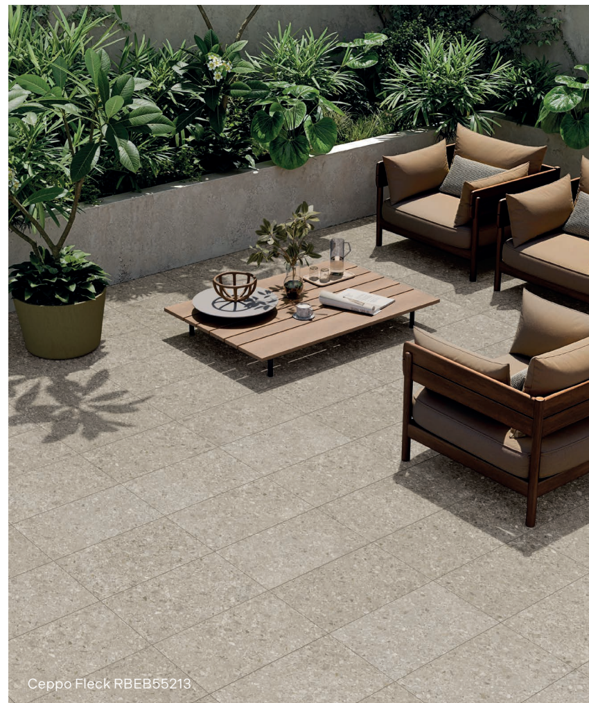
Ceppo Fleck RBEB55213