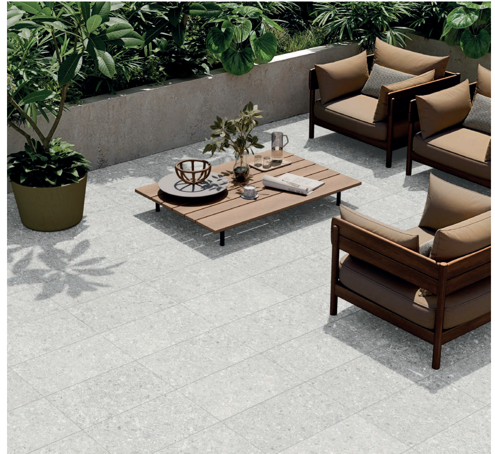
Above Ceppo Fleck RBEB55209

LRV and PTV values can vary batch to batch, please contact for advice. Switch colours may vary, samples should be requested.