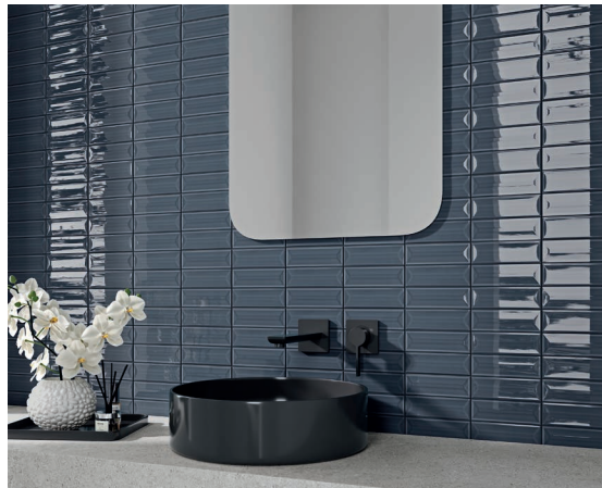
Right Reflex EWDB48295