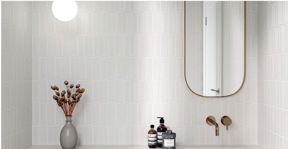
Above Reflex EWDB48299