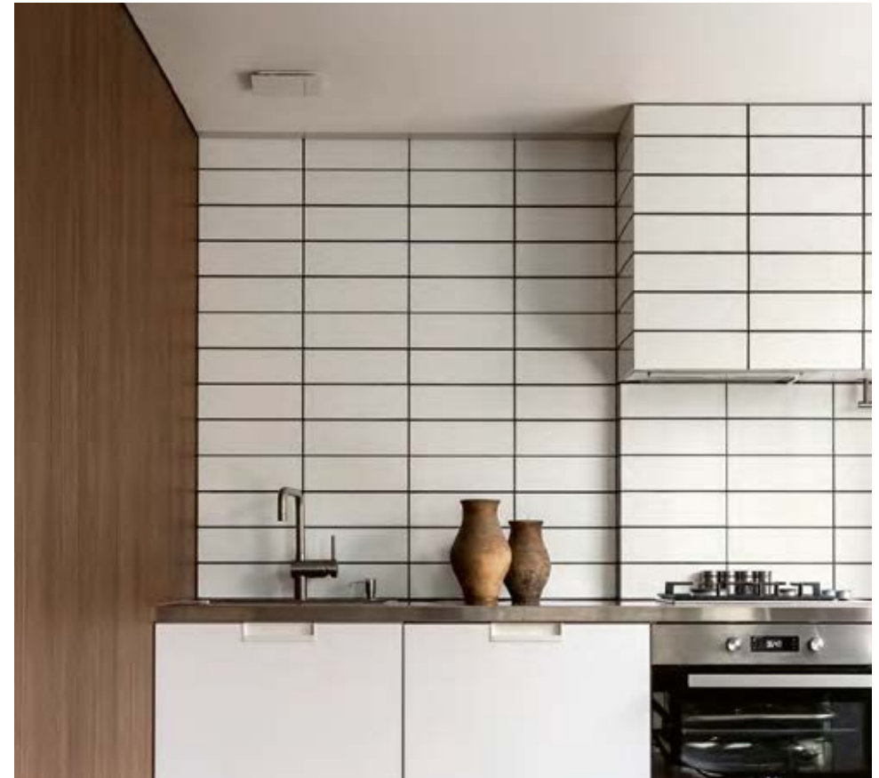
Above Kakam 3.0 YCDA54200