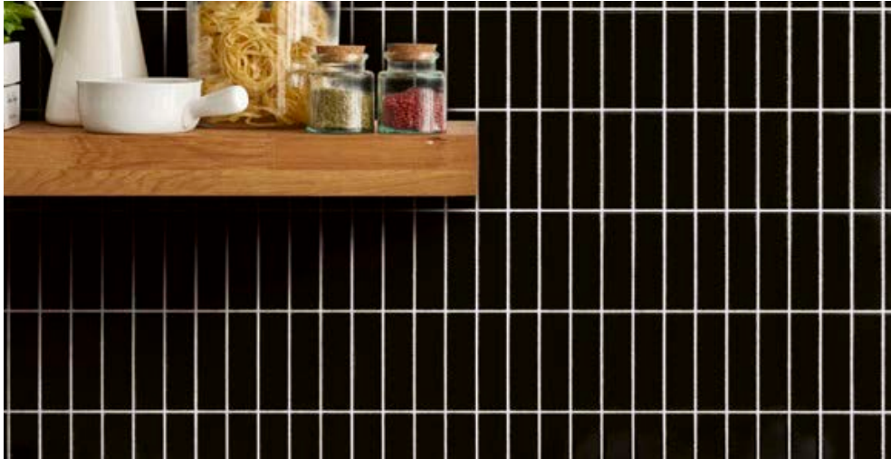
Above Kakam 3.0 YCDA54203