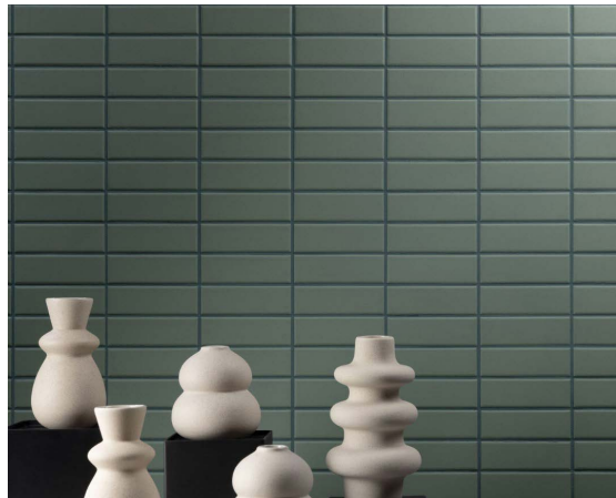
Right Kakam 3.0 YCDA54207