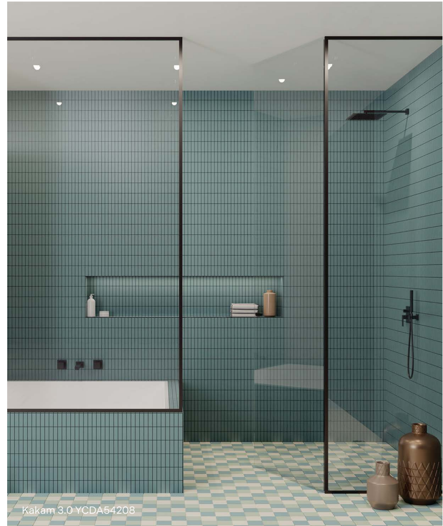
Kakam 3.0 YCDA54208