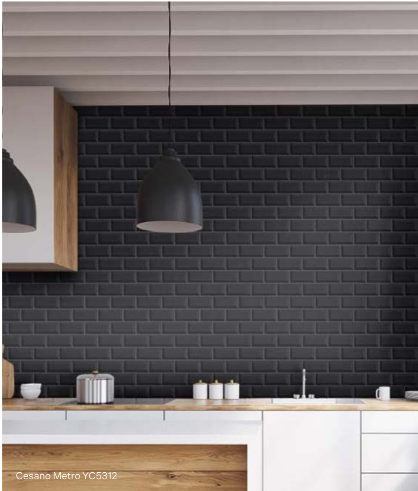
Cesano Metro YC5312