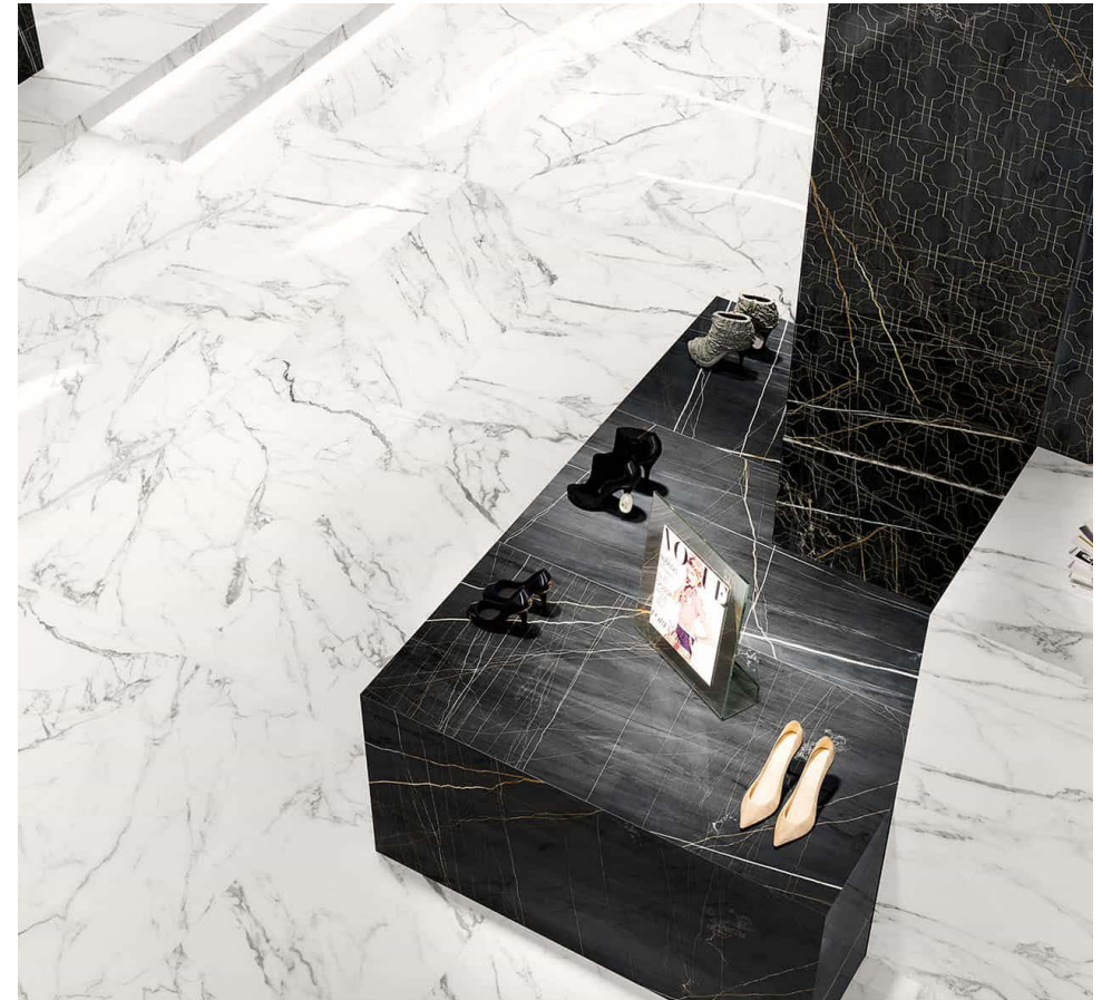
Above Cassandra SCAA5082 SCAA5084

LRV and PTV values can vary batch to batch, please contact for advice. Switch colours may vary, samples should be requested.