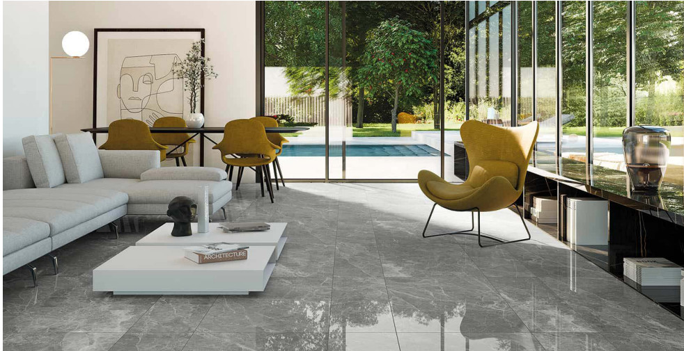
Above Cassandra SCAA5083