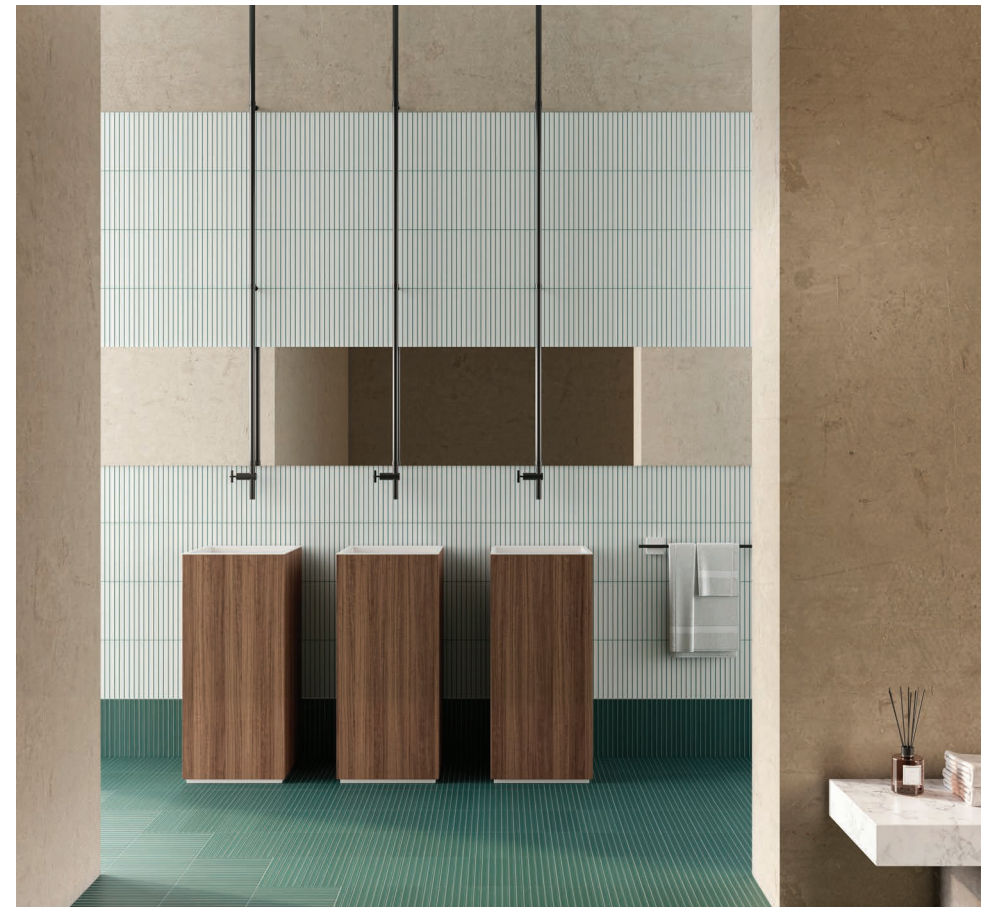
Above: Vali SFCB45920 SFCB45925

LRV and PTV values can vary batch to batch, please contact for advice. Swatch colours may vary, samples should be requested.