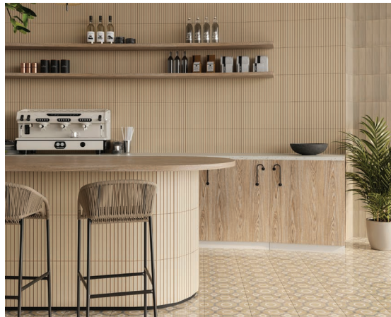
Right Vali SFCB45920 SFCB45926