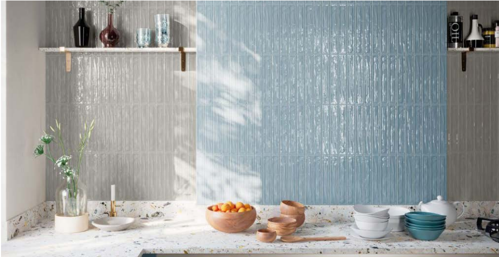
Above Poole SCDC47134 SCDC47136