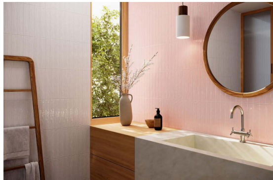
Right Poole SCDC47131 SCDC47138