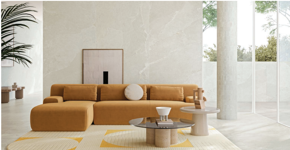
Above Cellan GRCD37772