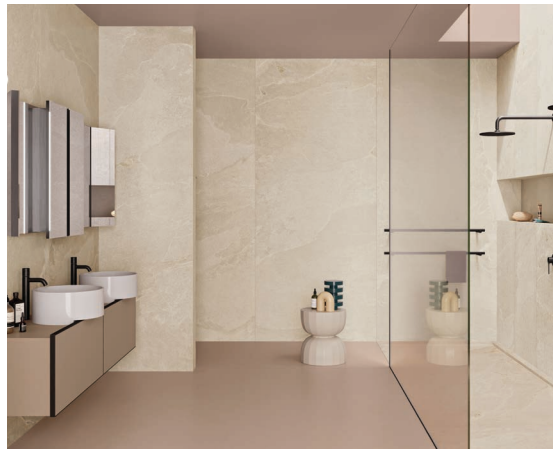
Right Cellan GRCD37775