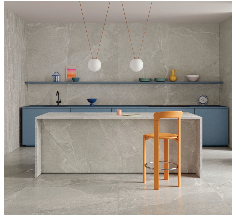
Above: Cellan GRCD37773