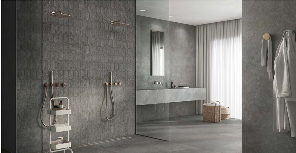
Above Cammock FVCB52416 FVCB52416T1