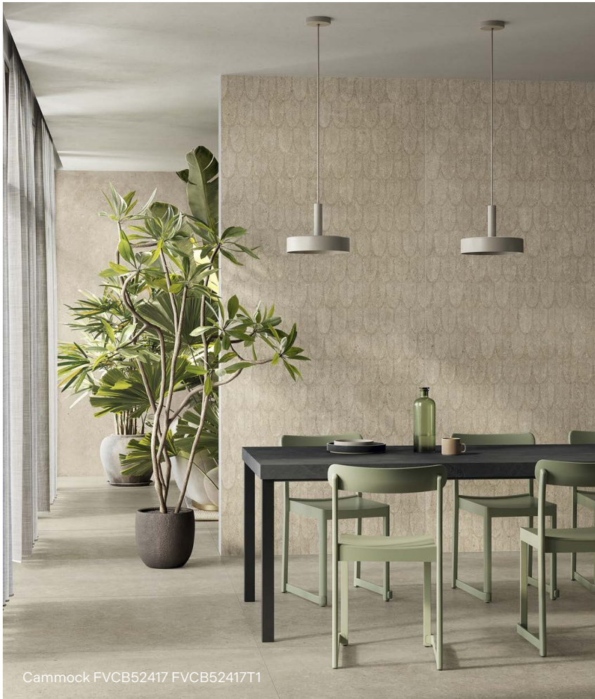
Cammock FVCB52417 FVCB52417T1