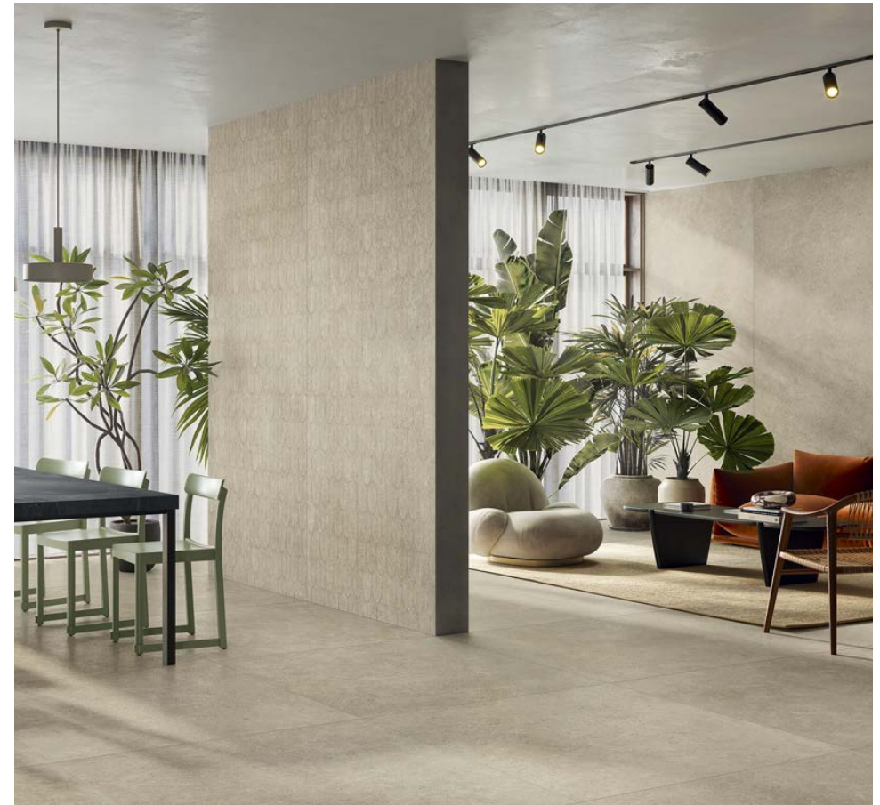
Above Cammock FVCB52417 FVCB52417T1