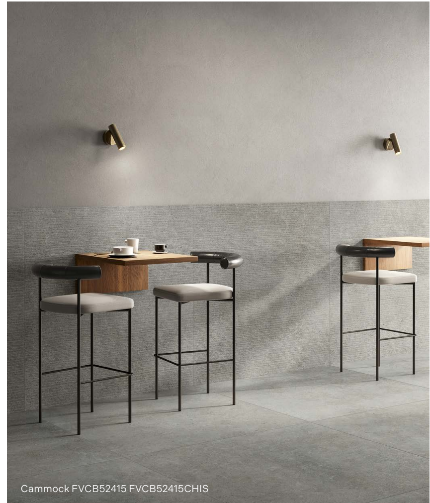
Cammock FVCB52415 FVCB52415CHIS