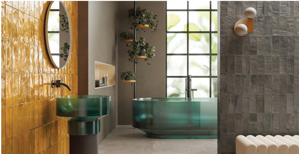
Above Wall: PECB53502 PECC53508