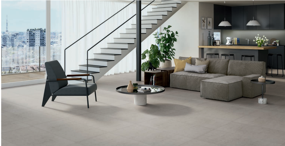
Above Romney PDCC51074