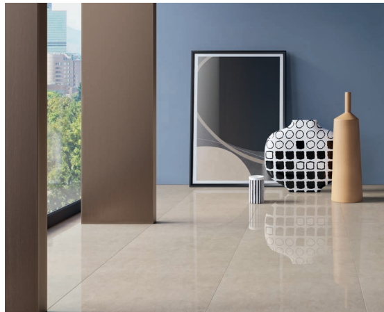
Right Romney PDCC51077POL