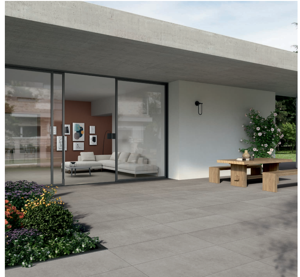
Above Romney PDCC51075HAM