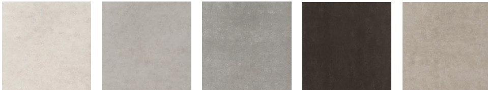
PDCC51073 PDCC51074 PDCC51075 PDCC51076 PDCC51077