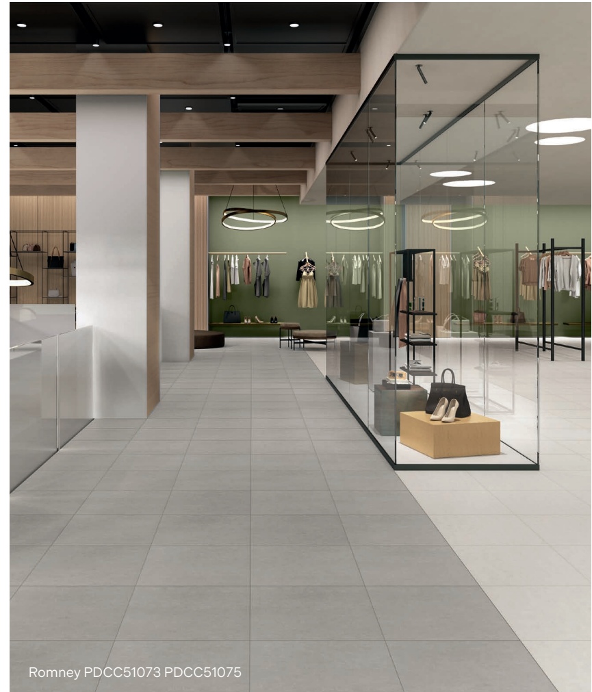
Romney PDCC51073 PDCC51075