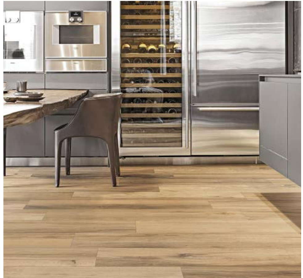
Above Floor: PERT42360