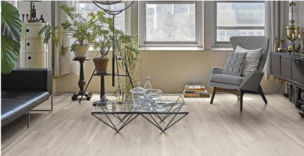
Above Floor: PERT42356