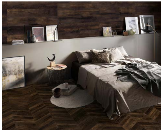
Right Floor: PERT42358