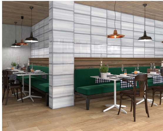
Right Wall: CIT34990 CIT34993