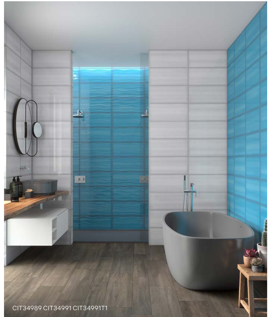
CIT34989 CIT34991 CIT34991T1

LRV and PTV values can vary batch to batch, please contact for advice. Swatch colours may vary, samples should be requested.