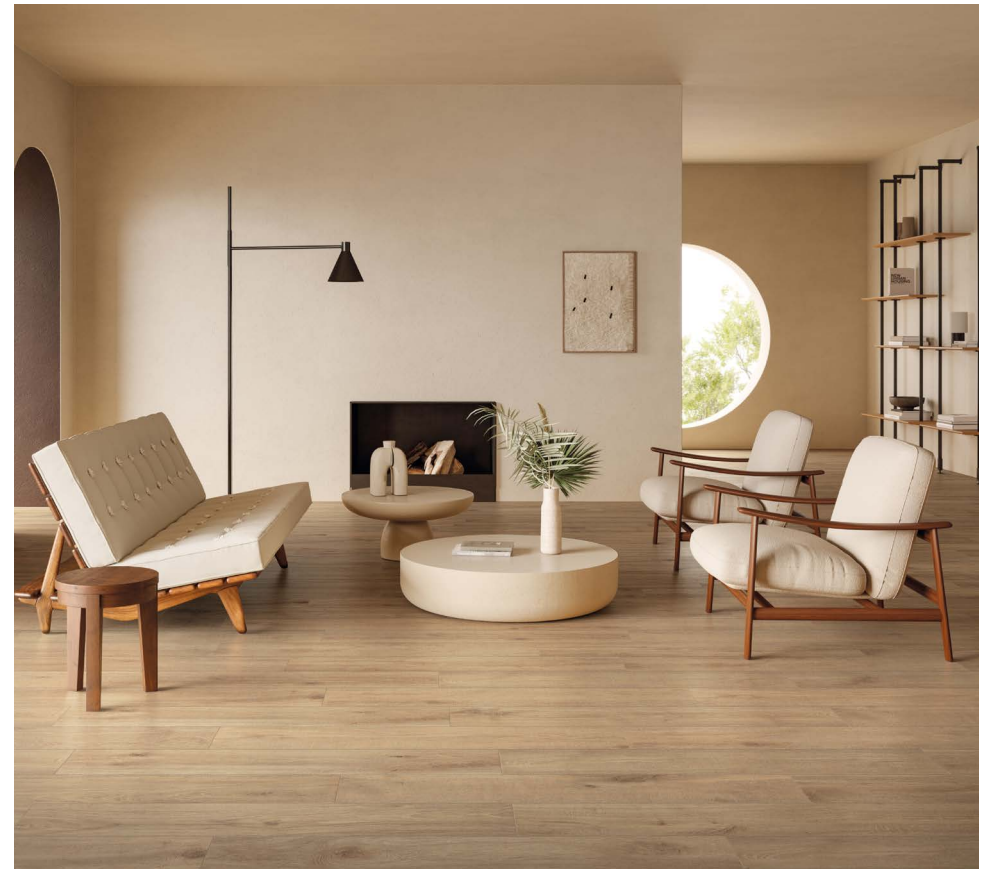
Above Dering 2.0 GRCA37792