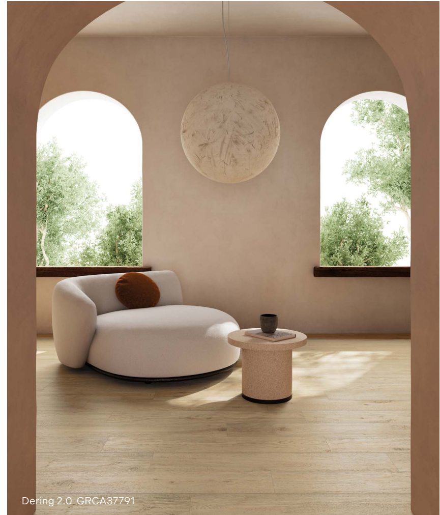
Dering 2.0 GRCA37791