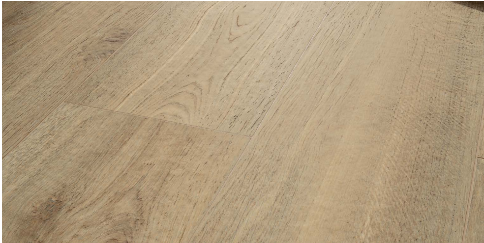
Above Dering 2.0 GRCA37791