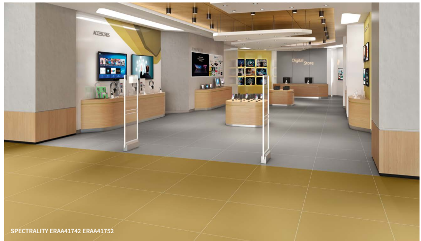
SPECTRALITY ERAA41742 ERAA41752