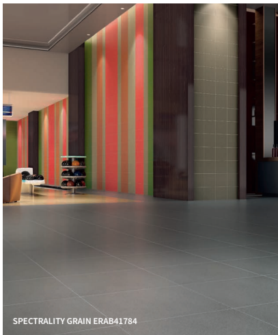
SPECTRALITY GRAIN ERAB41784