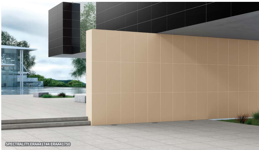
SPECTRALITY ERAA41744 ERAA41750