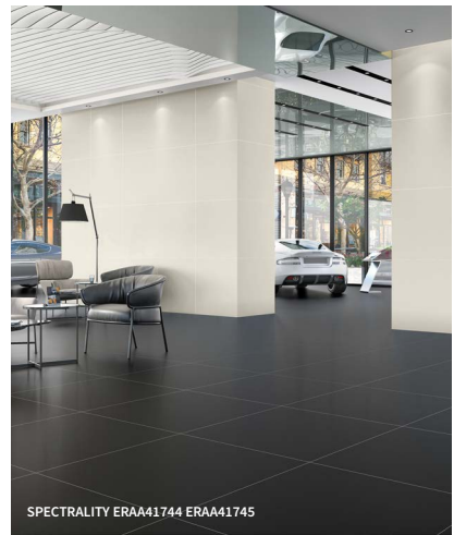
SPECTRALITY ERAA41744 ERAA41745