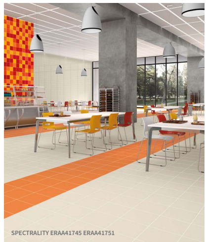
SPECTRALITY ERAA41745 ERAA41751