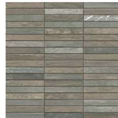
KAAM49454 15x100 MOS