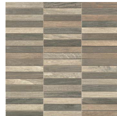
KAAM49453 15x100 MOS