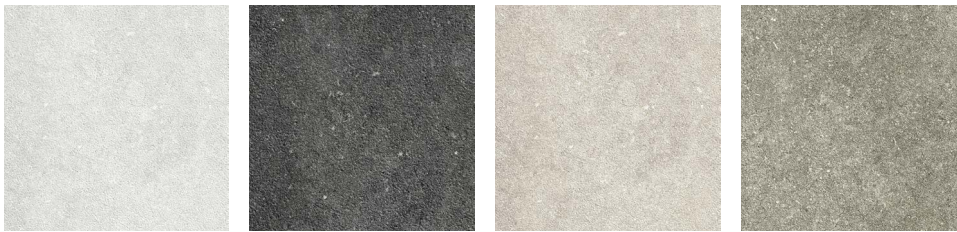
KAAD49417 LRV 41