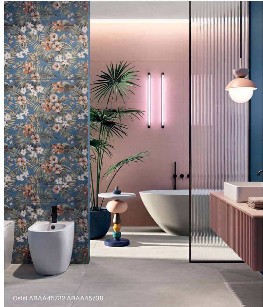
Osisi ABAA45732 ABAA45738