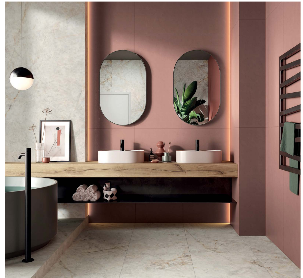
Above Osisi ABAA45735