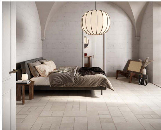
Right Floor: TMLH48650