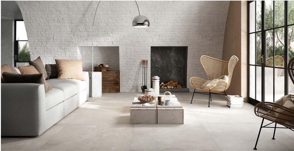
Above Floor: TMLH48650