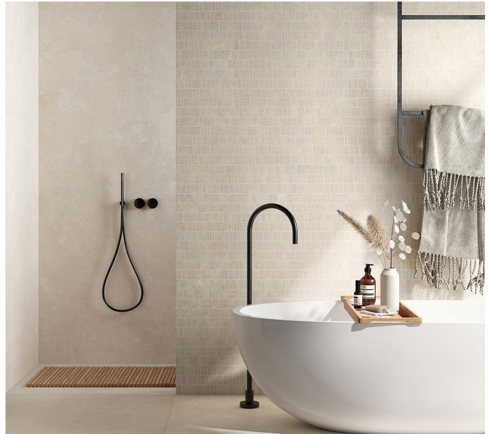
Above Floor: TMLH48650 Wall: TMLH48650DEC

LRV and PTV values can vary batch to batch, please contact for advice. Swatch colours may vary, samples should be requested.