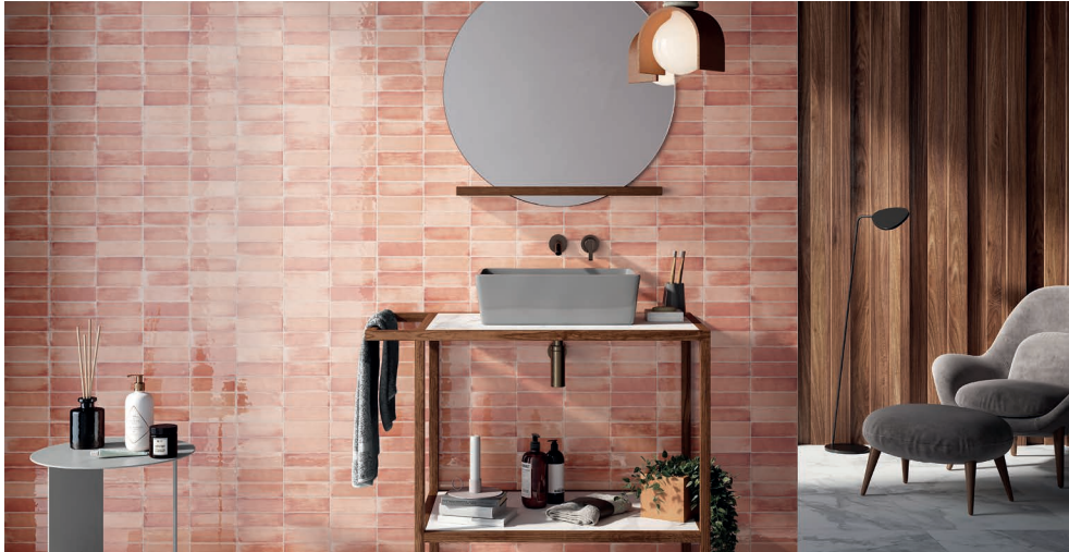
Above Wey TSTB48611