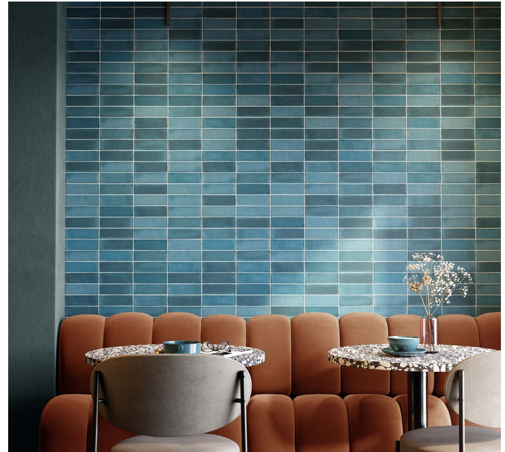
Above Wey TSTD48694

LRV and PTV values can vary batch to batch, please contact for advice. Switch colours may vary, samples should be requested.