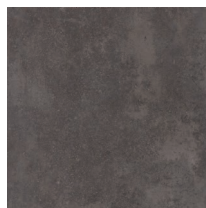
LAP9576 LRV: 23