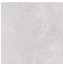
LAP9574 LRV: 60