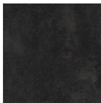
LAP9577 LRV: 11