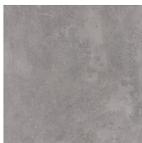
LAP9575 LRV: 43