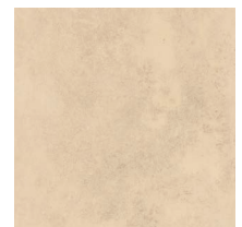
LAP9571 LRV: 34