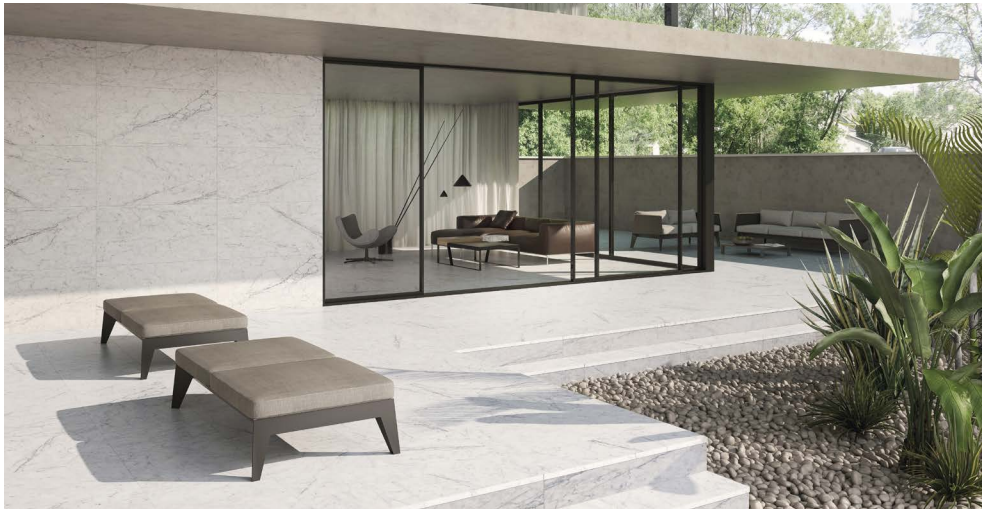
Above Ramunai 2.0 AAV44364 AAV44364BRU