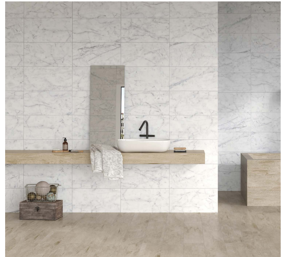
Above Ramunai 2.0 AAV44364BRU