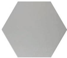
QTA39141 PEI 4