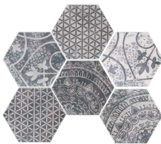
QTA39145* PEI 3

*If being used on floor, please contact for technical advice