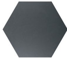
QTA39142* PEI 3