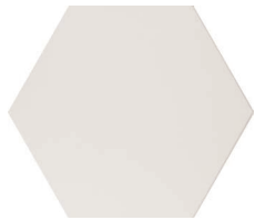
QTA39140 PEI 4