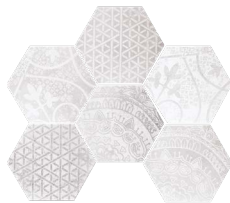
QTA39144* PEI 3