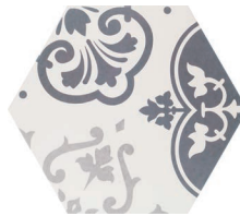
QTA39143* PEI 3