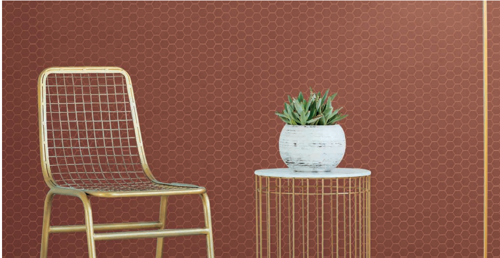
Above Sagoon TNI43889