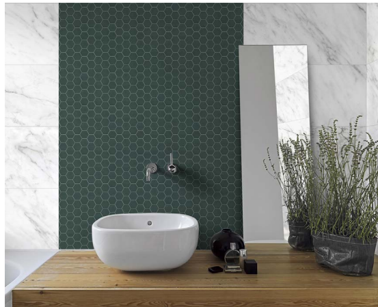
Right Sagoon TNI43815