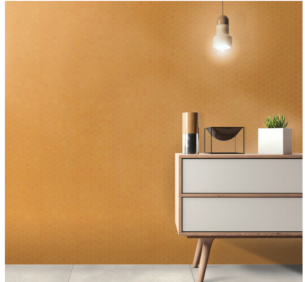
Above Sagoon TNI43891