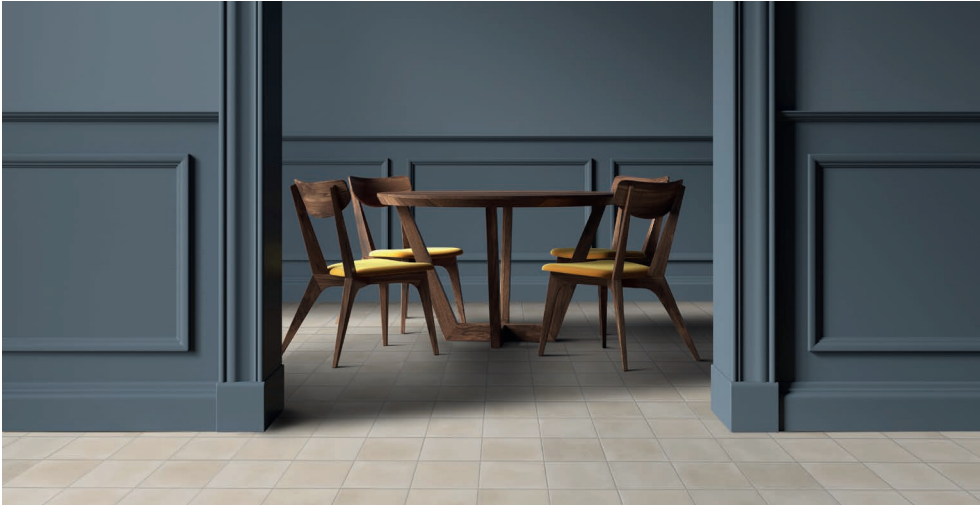
Above Powder TSD43877