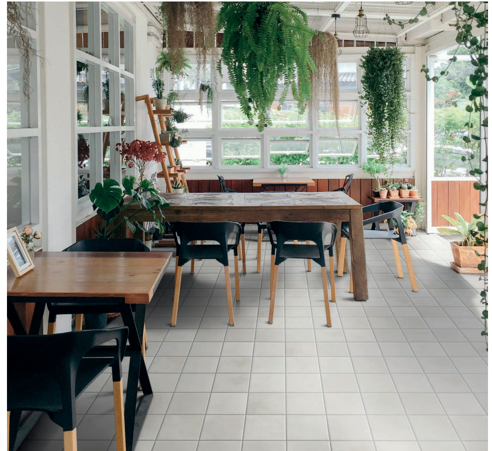
Above Powder TSD43875