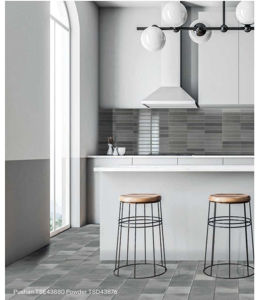
Pushan TSE43880 Powder TSD43876

LRV and PTV values can vary batch to batch, please contact for advice. Swatch colours may vary, samples should be requested.