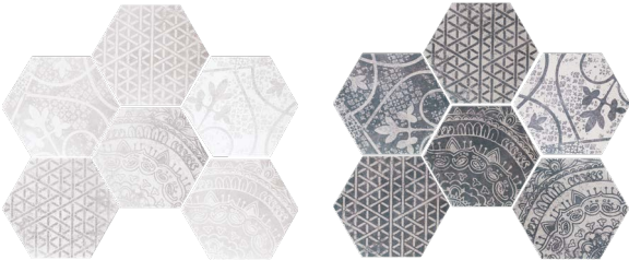
QTA39144* PEI 3