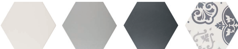
QTA39140 PEI 4