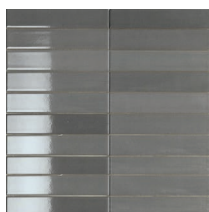
TSE43880 LRV: 26