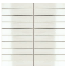
TSE43878 LRV: 71