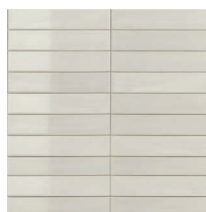
TSE43881 LRV: 55