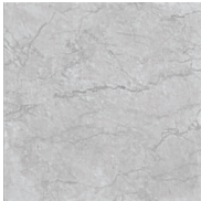
TMMO43850 LRV: 39