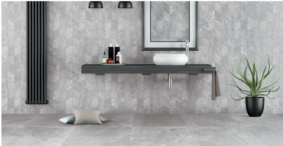
Above Floor: TMMO43850 Wall: TMMO43850CHEV