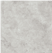
TMMO43849 LRV: 59