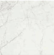
TMMO43848 LRV: 66