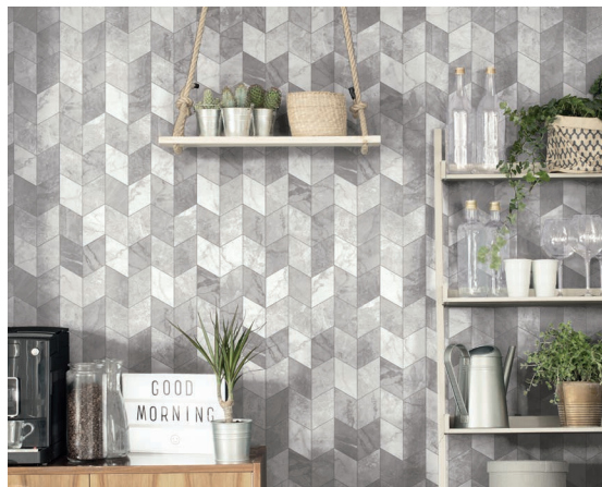
Right Wall: TMMO43859RHOM