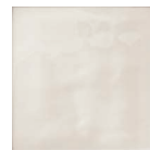
QTG39102 LRV: 53