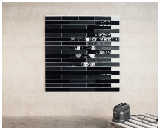
Right Ewell QTG39103 QTG39111