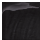
QTG39103 LRV: 0