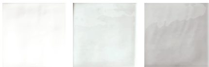
QTG39100 LRV: 73