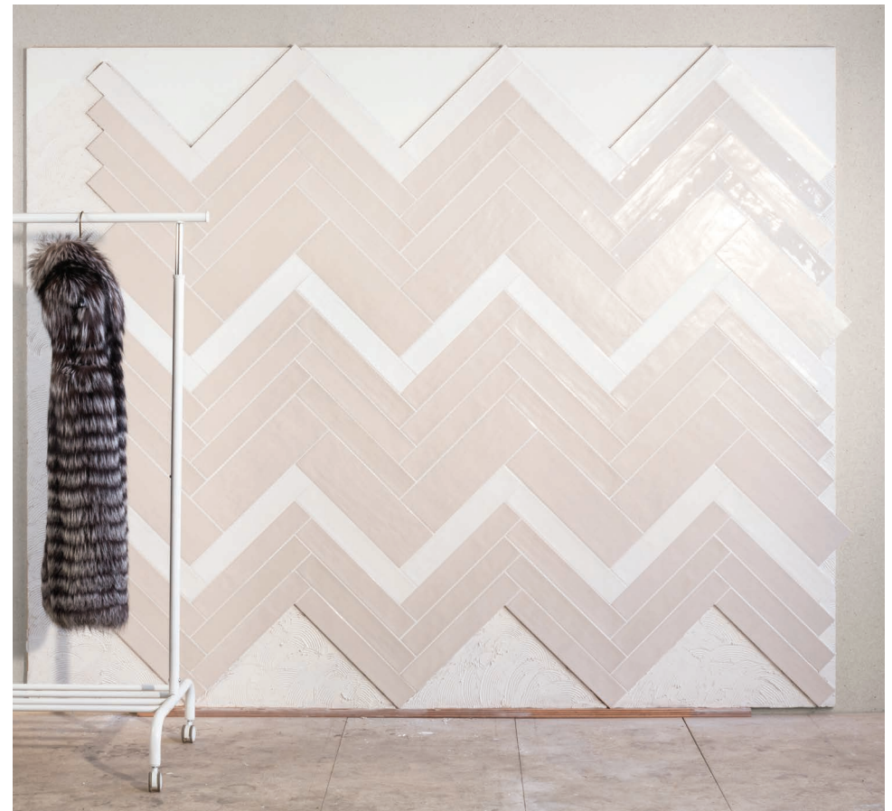
Above Ewell QTG39100 QTG39101 QTG39102

LRV and PTV values can vary batch to batch, please contact for advice. Swatch colours may vary, samples should be requested.