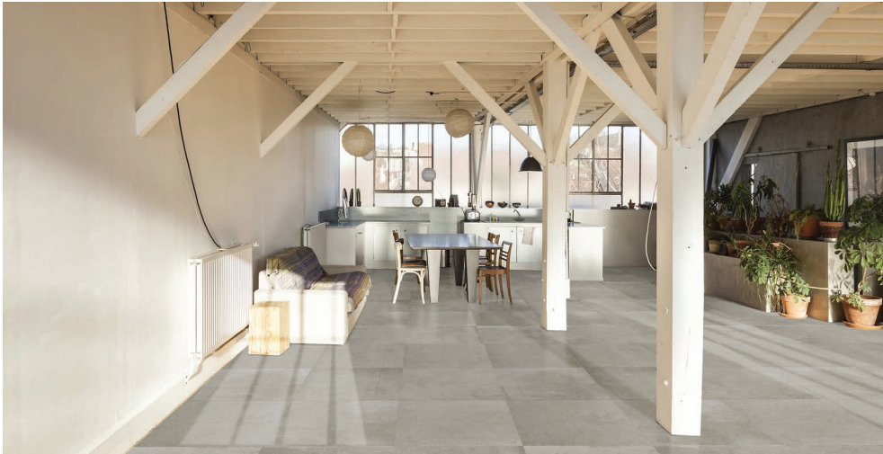
Above Floor: TTT30360