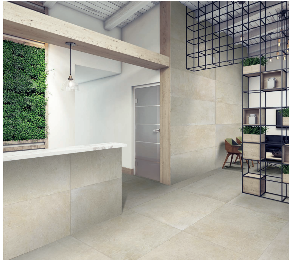
Above Wall: TTT30359 Floor: TTT30359

LRV and PTV values can vary batch to batch, please contact for advice. Swatch colours may vary, samples should be requested.