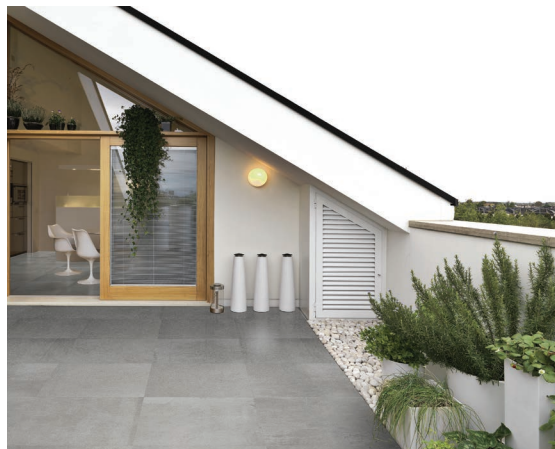
Right Floor: TTT30361THK