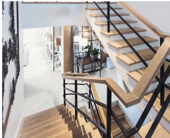
Right Wall: TMRM46215