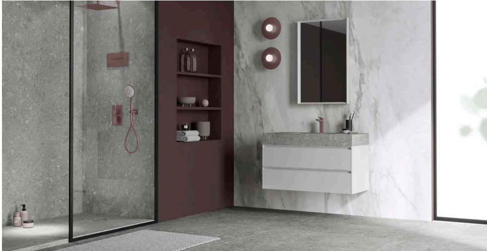
Above Wall: TMRM43899HON