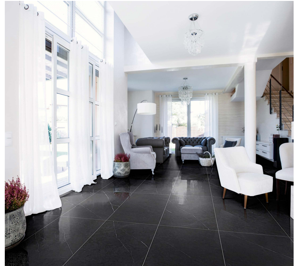
Above Wall: TMRM32152POL