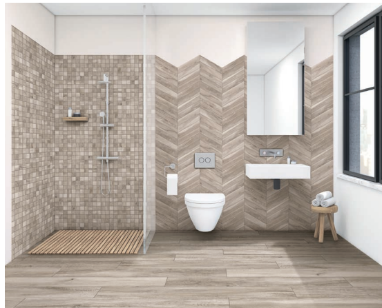
Right Floor: TMMN32174 Wall: TMMN3217CHEV, TMMN3217MOS