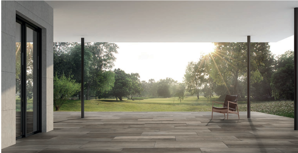
Above Floor: TMMN32173THK