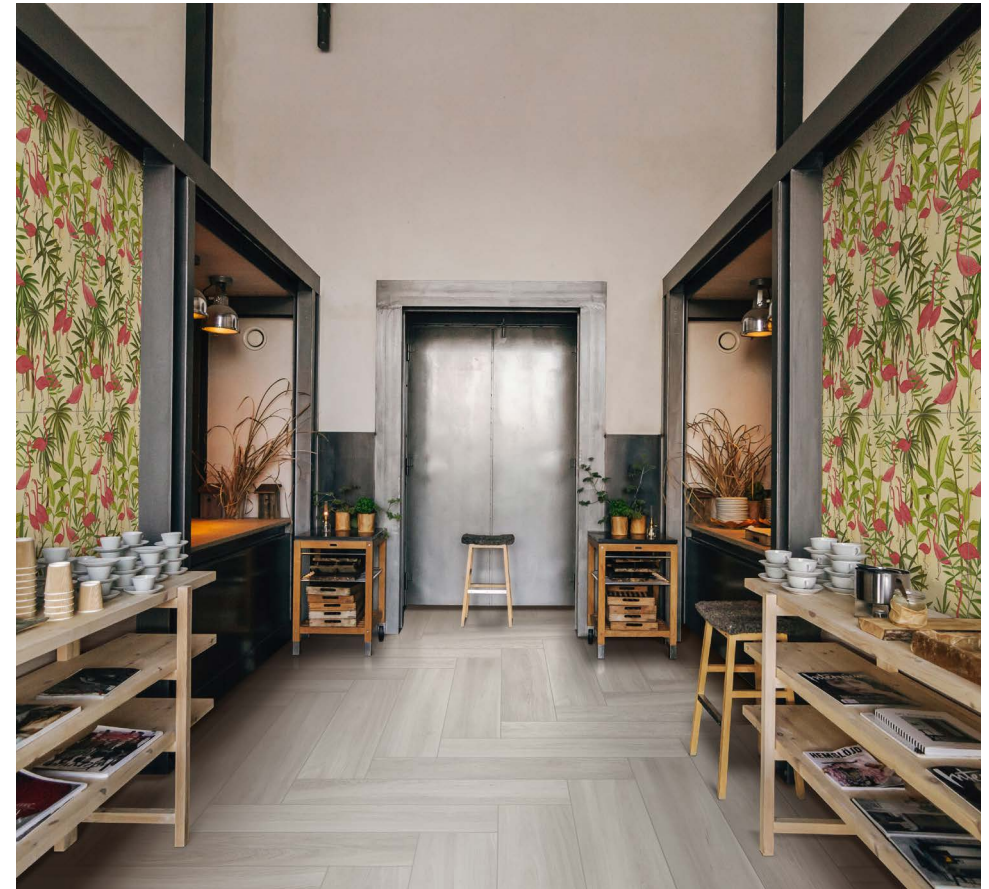
Above Floor: TMMN46219

LRV and PTV values can vary batch to batch, please contact for advice. Swatch colours may vary, samples should be requested.