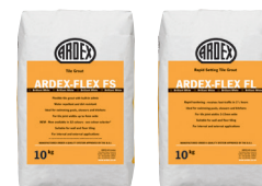
ARDEX-FLEX FL Rapid Setting Flexible Tile Grout for Wide Joints