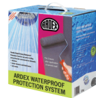
ARDEX WPC Waterproof Protection System

NOTE: If the aerated concrete blockwork is not suitably flat to receive ceramic tiling, the use of ARDEX AM 100 Rapid Hardening One Coat Tiling Render should be considered.