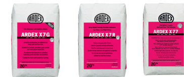
ARDEX X7 Standard Setting Flexible Tile Adhesive

NOTE: If the aerated concrete blockwork is not suitably flat to receive ceramic tiling, the use of ARDEX AM 100 Rapid Hardening One Coat Tiling Render should be considered.